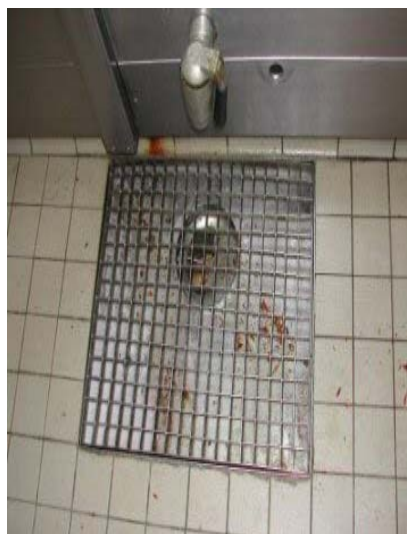
BIODRAIN application example