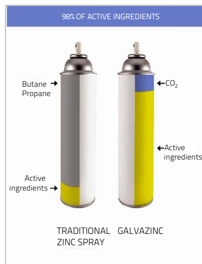
GALVAZINC application example