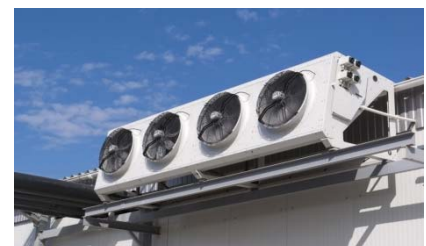
REFRIOX application example